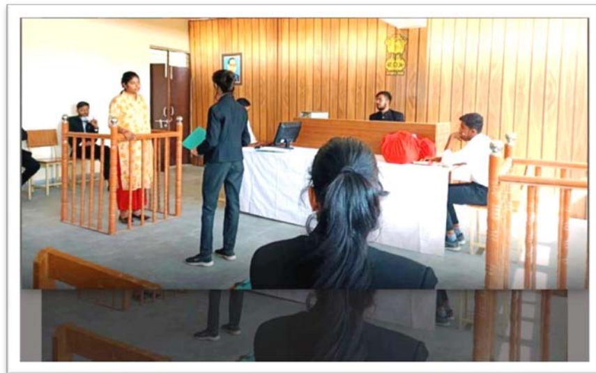
Moot Court Department of Law