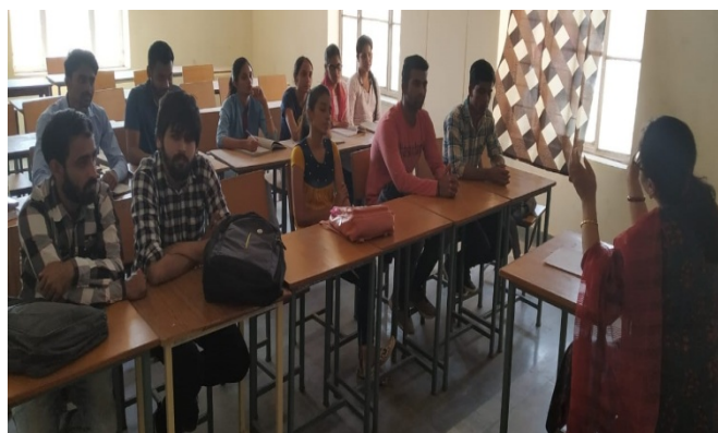
Teacher-Student interface during the Remedial Coaching Session

Remedial Coaching Cell functions with the spirit to bring teaching and learning to near perfection. The Coaching Cell becomes functional in the last one and a half month of every Semester. The objectives of the Cell are to conduct the diagnostic test to find out the strengths and weaknesses of teaching and learning, so as to utilize the strengths to make teaching learning process more effective and to evolve a process to eradicate the weaknesses of teaching and learning.