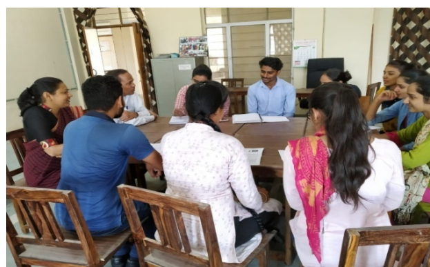
Teacher- Students interaction during Career Counselling Session

To ensure the overall development of the students and to equip them with the information that helps them to be better placed, the Department has constituted a Career Counselling Cell. All the Faculty Members are the Members on the Cell with one Faculty Member serving as Co-ordinator. The objectives of the Cell are to educate the students on the current issues which are not the part of students' curriculum, to update them on the current vacant job positions, to suggest them the devices and ways which can