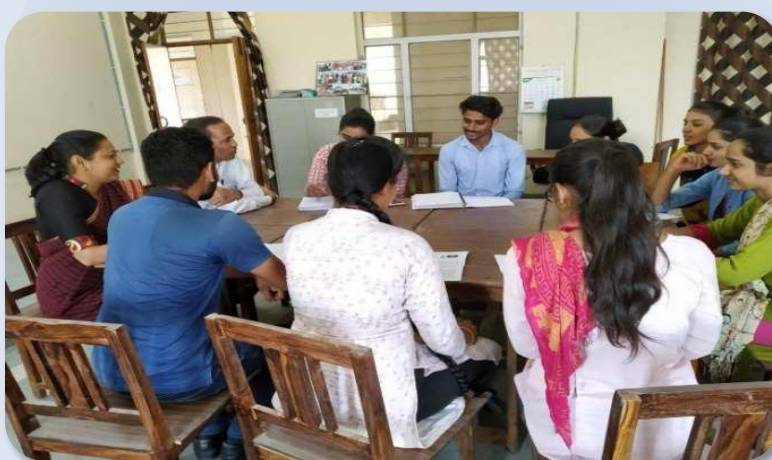
Teacher- Student interaction during Career Counselling Session

To ensure the overall development of the students and to equip them with the information that helps them to be better placed, the Department has constituted a Career Counselling Cell. All the Faculty Members are the Members on the Cell with one Faculty Member serving as Co-ordinator. The objectives of the Cell are to educate the students on the current issues which are not the part of students' curriculum, to update them on the current vacant job positions, to suggest them the devices and ways which can make them good human beings and better citizens of the country and to generate awareness about the socio-economic concerns amongst them which impact the society in some or the other way. The vibrant Career Counselling Cell holds collective as well as individual meeting with the students to find out the remedies of the problems the students have or are likely to face in near future. The micro and macro analysis of the problems is done, and solutions are arrived at.