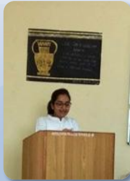
A Student Presenting her Paper in the Classroom Seminar

Classroom Seminars: The classroom seminars are conducted twice in a month. It is a gathering of students for the purpose of discussing a stated topic. Such gatherings are usually interactive sessions where the participants engage in discussions about the delineated topic. All the faculty members also attend these seminars, listen to the presentations, and render their suggestions.