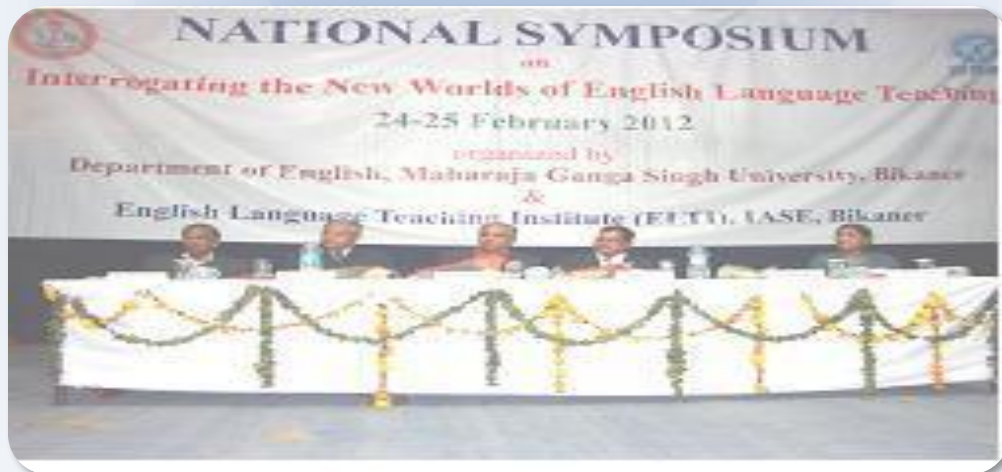
National Symposium on Interrogating the New Worlds of English Language Teaching organised on 24-25 February, 2012

National/ International Seminars/Conferences/Symposia/Webinars: The Department organises Seminars and Conferences at regular Interval. Seminars are events that are mostly geared towards educational topics and usually feature one or more experts on the subject matter. It helps to create new knowledge and contribute to the existing knowledge, forms. It helps the University widen the interface with academia and industry while creating a better learning environment on the campus.