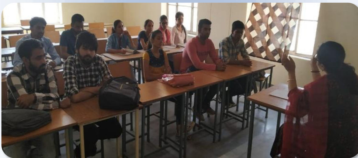
Teacher-Student interface during the Remedial Coaching Session

The Cell operates in a systematic way. Slow and advanced learners of every area are identified, and thereafter the advanced learners are asked to guide the slow learners. The faculty members concerned guides the slow learners and enable them identify their weaknesses and suggest the ways to eradicate them. All the Faculty Members are Office Bearers of this cell. The Head of the Department is the Director of the Cell and all the Faculty Members serve as Members. Owing to the vibrant functioning of the Remedial Coaching Cell the Department has given cent percent results since its establishment.