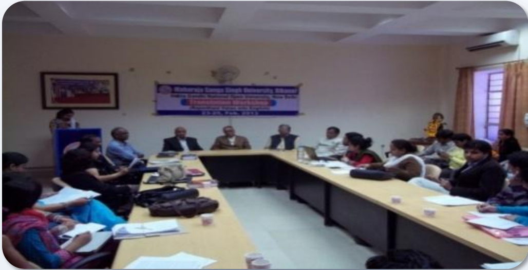
Translation Workshop aiming at Translating Rajasthani Vatas into English in collaboration with IGNOU organised from 23 to 25 February, 2013