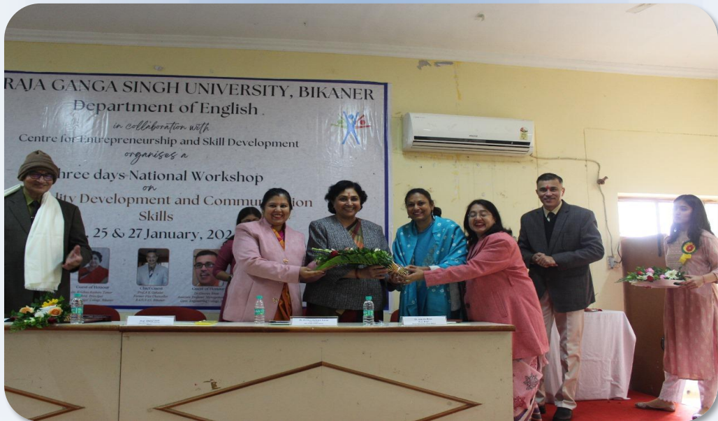
National Workshop on Personality Development and Communication Skills organised from 24 to 27 January, 2024