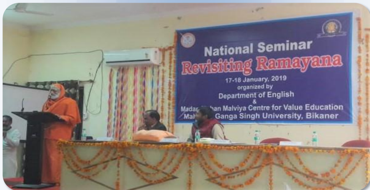
National Seminar on Revisiting Ramayana organized by Department of English & Madan Mohan Malviya Centre for Value Education on 17-18 January, 2019