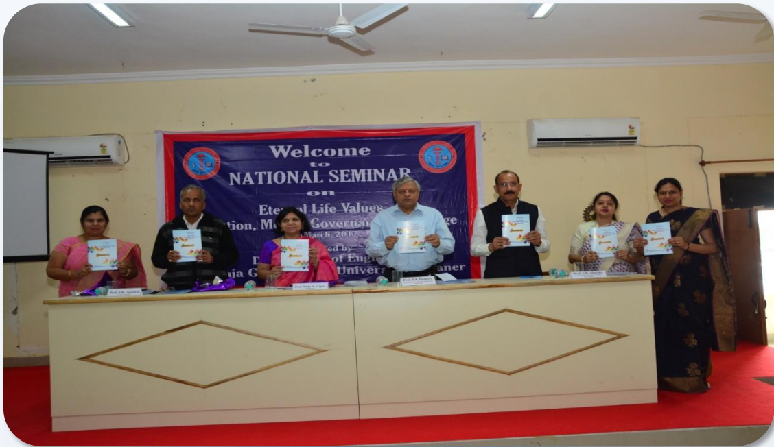
Nation Seminar on Eternal Life Values: Education, Media, Governance and Change organised on 3-5 March, 2017