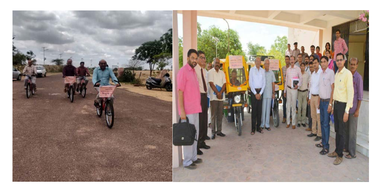
Use of bicycles/ Battery-powered vehicles