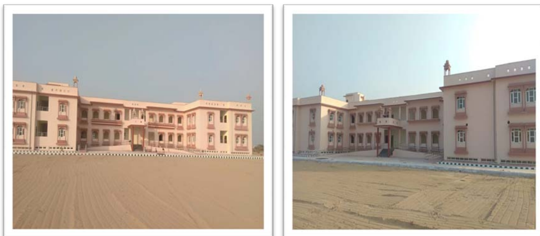
Newly Developed Academic Buildings III and IV

New classrooms and research laboratories imparting new academic programmes have been established. The University has evolved other plans to have state of art infrastructure on its campus.