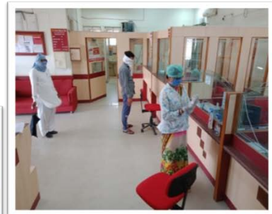
PNB Bank, MGSU Branch