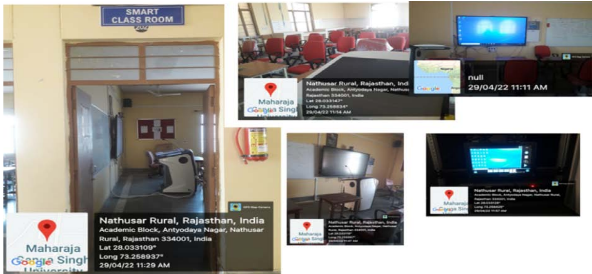
Photograph of one of the Smart Classrooms