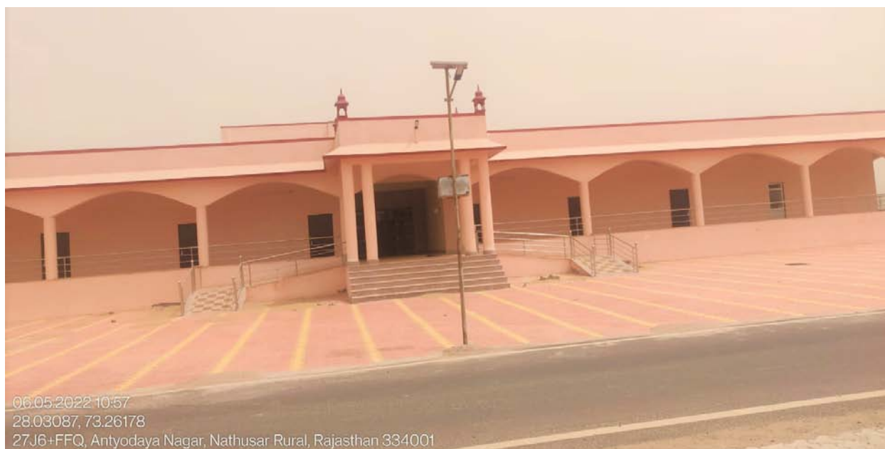
Innovation and Incubation Cell

Innovation and Incubation Centre has been established on the University campus to promote research and innovation and encourage the establishment of Start-Ups to create a base for a self-reliant India. The Innovation and Incubator Cell has prepared the Startup and Innovation Policy based on the guidelines provided by MHRD: Govt. of India.